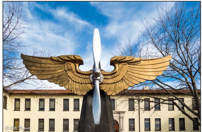
SCENE ON CAMPUS: Wright State University, Air Force ROTC building, Dayton, OH

Do you have a good structure in place to identify your veteran and military service students so that you can provide the registration priority? The toolkit (referenced in the next paragraph) provides a sample template for identifying the students, and additional information about tracking and managing information about the students. If you have some priority structure in place for students, you need to determine "where" within that structure your institution wants to place veteran and military students. The legislation doesn't go into that level of detail. Some examples are included in the toolkit. If you don't have any priority registration at your institution, it would be a good idea for you to tap into some of the resources available from the toolkit .