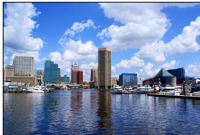
Baltimore, MD Inner Harbor