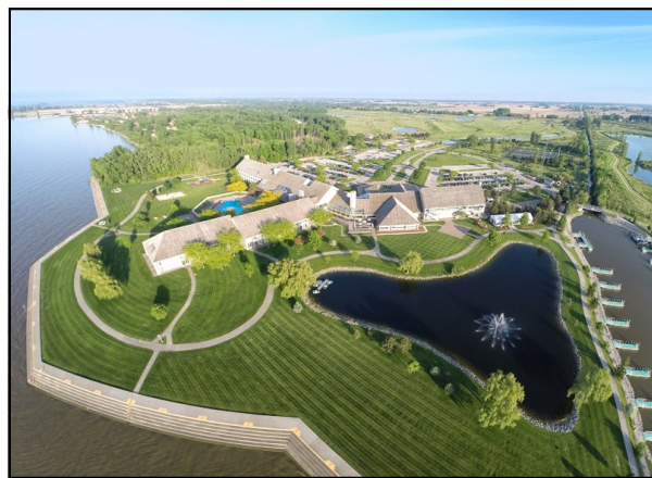
Maumee Bay State Park