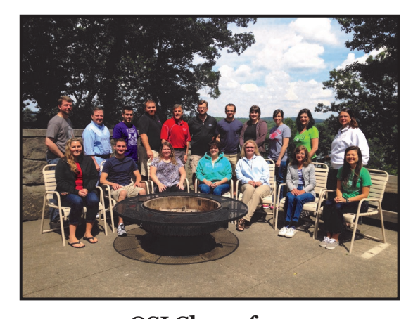
OSI Class of 2014

Some of the session topics were FERPA, Strengths Assessment, Politics of Change, Government Relations, Office Morale, and more. The participants had opportunities to vocalize questions in a small, personal setting that you wouldn't normally find in a larger conference.