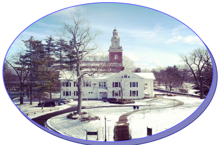
SCENE ON CAMPUS : Denison University