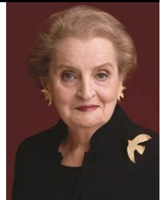
AACRAO Featured Speaker

Ohio AACRAO always has a strong showing so there will be plenty of people you know in attendance. If you cannot make it, be sure to watch for #AACRAO2015 on Twitter and follow us @OhioAACRAO. See you there!