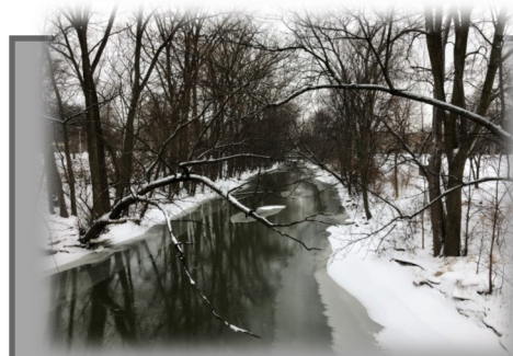
University of Toledo