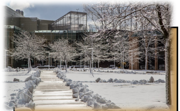
Lorain County Community College