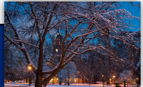
Ohio State University