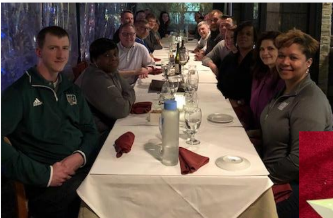
OACRAO Dinner Fun!

Elbert W. Ockerman State and Regional Professional Activity Award