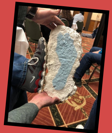
Anyone want to go searching for Bigfoot again??